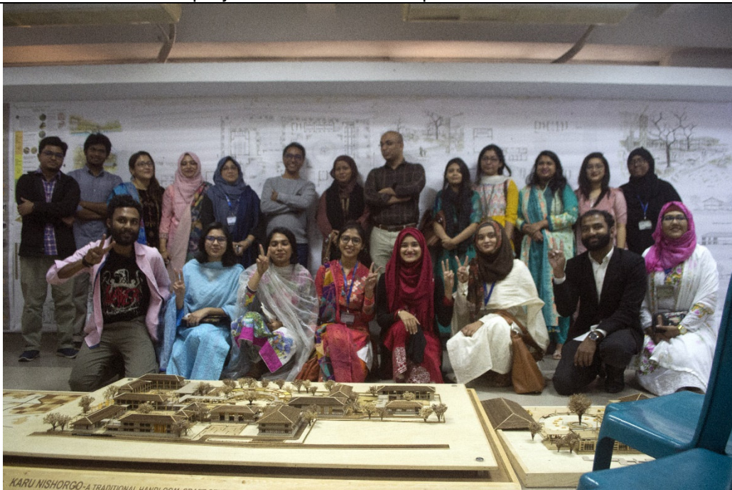
Passing students along with the faculty members and some jurors