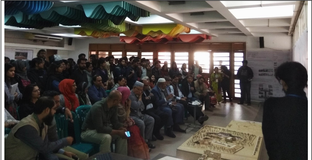
Students are presenting their thesis project in front of large audience

In continuation of its glorious journey, the Department of Architecture of the Ahsanullah University of Science and Technology (AUST), has recently organized a 'Final Year Thesis Jury' of Spring 2019' semester at its own campus. From 4 th February to 6 th February, 2020, a total of 29 students from the 33 rd batch presented their diversified thesis projects to the jury board.