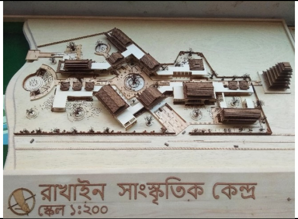
Verious architectural thesis projects and their formal presentation