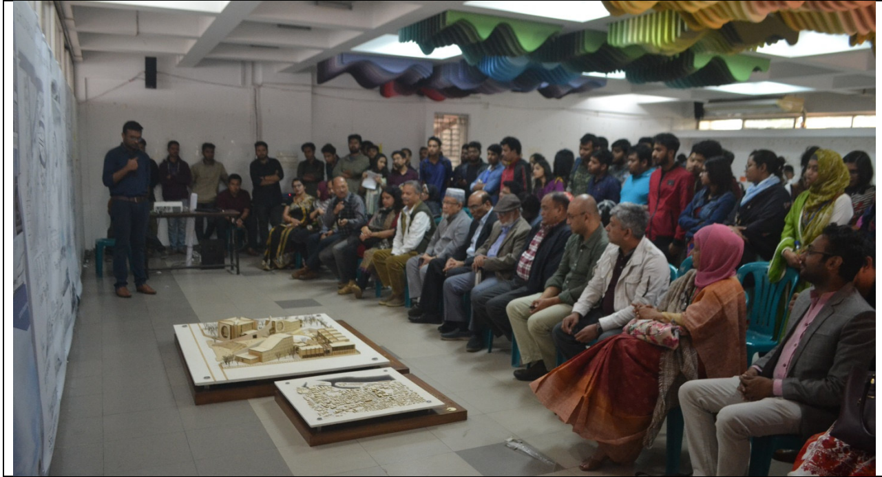
Jurers are critically evaluating the thesis projects