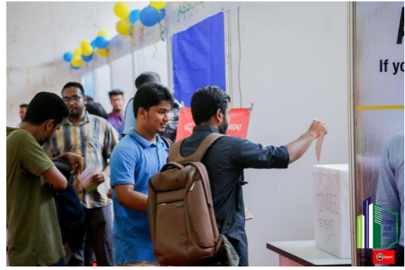
Students gathering information about the job opportunities from the different company professionals and submitting their CV