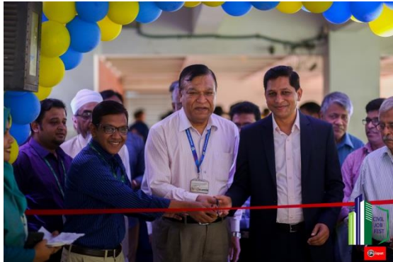
Opening of the gate of the program