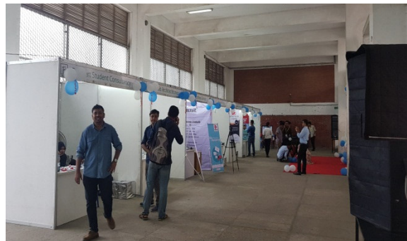
Stalls of Companies (2018)