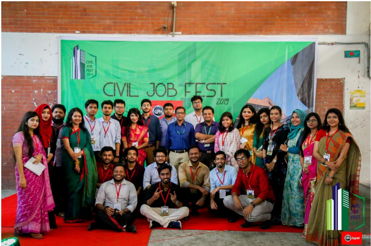
The organizing batch of the program with faculty members of CE