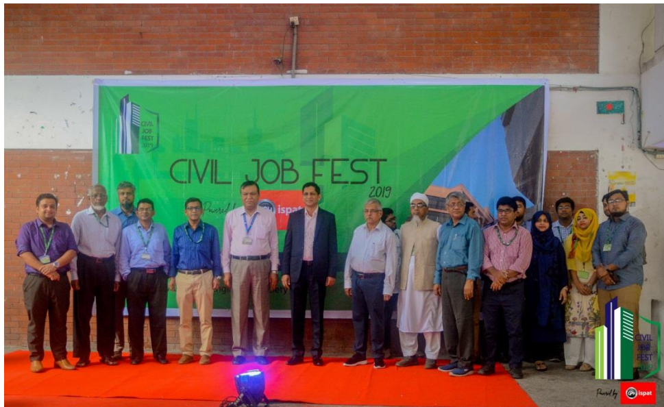
The Inauguration program of CE Job Fest 2019