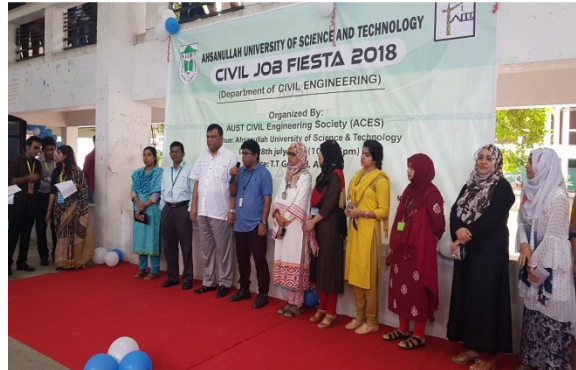
Opening of the CE Job Fest (2018)

A job Fair named: “Civil Job Fest 2018” was organized by the AUST Civil Engineering Society on 29 th July 2018 in AUST Campus. This event was a gathering of different company professionals with students, graduates and faculties of the Civil Engineering Department on a common platform. Seven companies: Mir Cement, Bashundhara Group, Anwar Group, Assure Group, Western Engineering (Pvt.) Ltd. and Studio Architectonic attended the festival. Fresher of CE department submitted their CV to the companies.